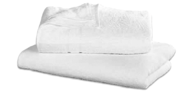
RULE 8 – On each chair, AL PALDROK will place a folded white towel and on the floor in front a large bottle of water for the performers to drink.

RULE 9 – AL PALDROK will set a CD player on the floor beside one of the two chairs. It should be plugged in to a power source and be connected to two loud speakers. It will be used to play THE