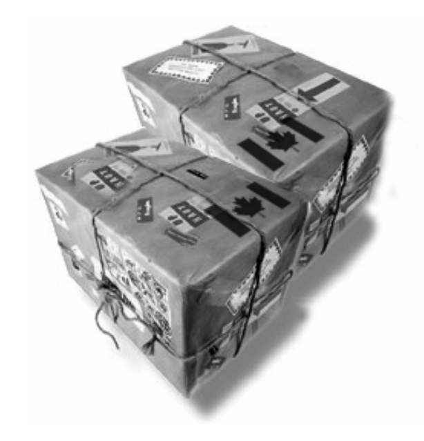
RULE 1 – Two packages will arrive from CANADA, one box from Montreal (Quebec), the other from Edmonton (Alberta).

RULE 2 – The Estonian artist AL PALDROK will receive the two packages between the dates of June 2- 9, 2006.