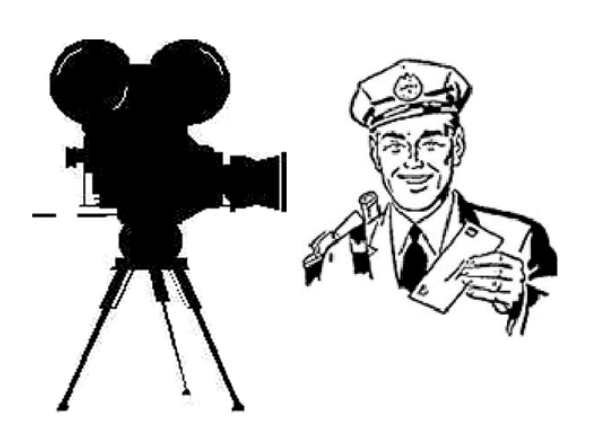
RULE 3 – The postman will arrive at the Academia Non Grata; AL PALDROK will take his video camera and film the postman for the package exchange.

RULE 2 – The Estonian artist AL PALDROK will receive the two packages between the dates of June 2- 9, 2006.