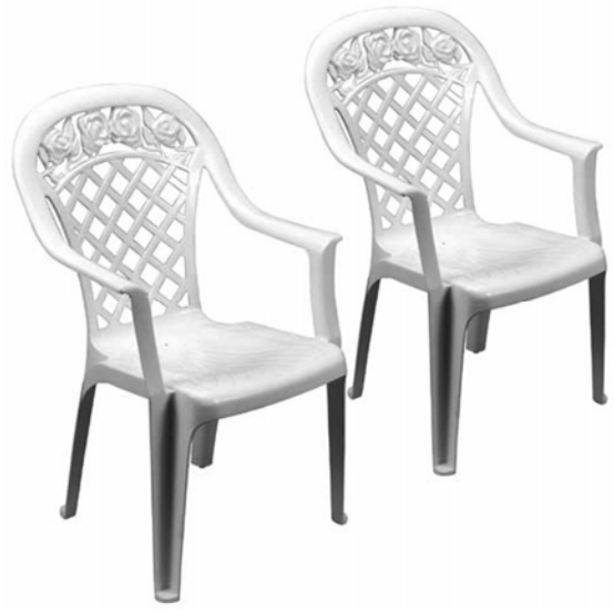
RULE 7 - THE SUBSTITUTES project will begin when AL PALDROK sets up the two white chairs at opposite ends of the room, from each other. If the performance is done on a tennis court then the chairs should be set up at opposite ends of the court.

RULE 6 - WARNING: The performance cannot start if the preparation rules 7 to rule 10 are not completed!